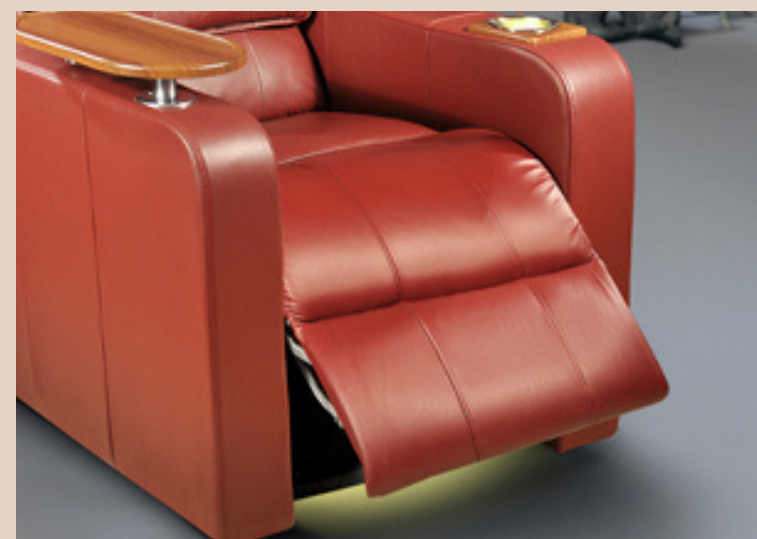
LEG REST AND FOOT STRIP LIGHTING