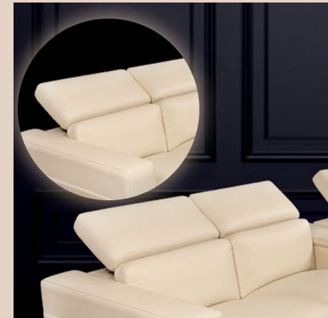
ADJUSTABLE HEAD REST