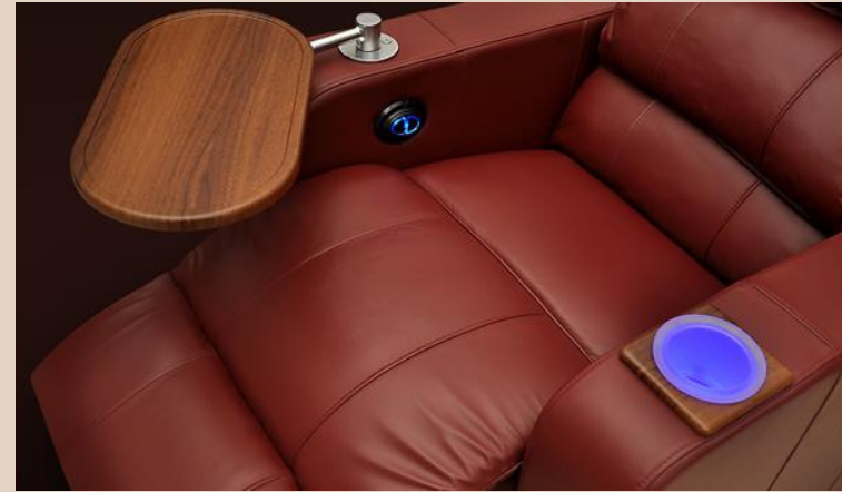
CUP HOLDERS & SWIVELTABLE

Today, seats in cinema are not mere seats anymore, they are equipped with many features.